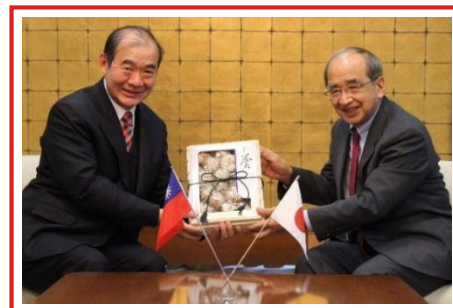
↑ A present of Oita-produced dried shiitake mushrooms, famous in Taiwan.