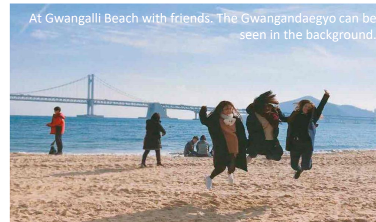
At Gwangalli Beach with friends. The Gwangandaegyo can be seen in the background.