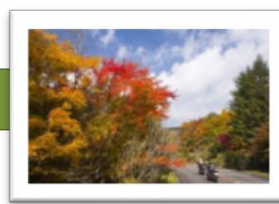
Kuju Kogen Road Park, Taketa