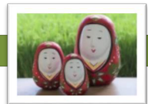
Hime Daruma Dolls, Taketa