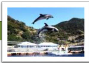
Tsukumi Dolphin Island, Tsukumi