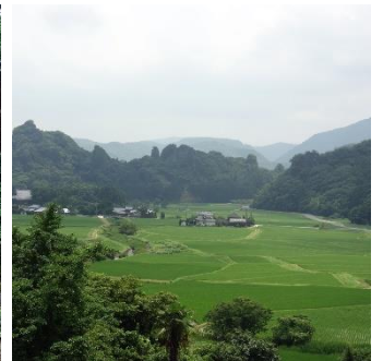
Locations, from bottom left to bottom right: Hanairo Spa, Tennenji, Choanji, Tashinobusho.

Accommodation: Yugen no yado, Category: Farm stay, Location: Bungotakada, Check-in: 16:00~, Price range: ¥ 10,000 for adult~,