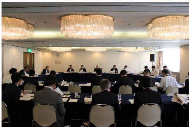
Overseas Initiative advisors' meeting, September 2018.

The initiative enacts as a compass for the prefecture's directions in its overseas activities. In the upcoming plan, focus will be placed on the realisation of new goals and the expansion of existing ones, mainly the enforcement on the export of agricultural, forestry, fishery, processed products and other items to nations in East Asia as well as ASEAN member states.