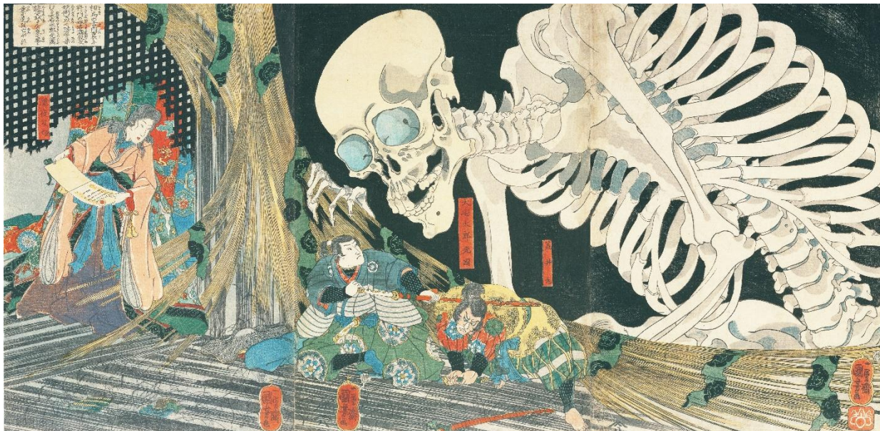
Utagawa Kuniyoshi, The Haunted Old Palace at Soma (Hagi Urugami Museum).

Aside from Toyoharu, the works of Kuniyoshi and Hiroshige are also displayed. While Toyoharu established the genre of bijin-ga ('pictures of beautiful women') and well-known for his mastery of one-point perspective, Kuniyoshi and Hiroshige are famed for their creative styles – both artists inherited the special qualities of the Utagawa school while covering a wide range of different genres with a distinctive touch.