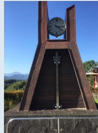
Below (clockwise): Notes carved into a rock, a roadside piano, and a music stand next to a metronome found in other locations in Taketa