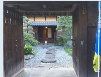
Left: Exterior of the Rentaro Taki Museum

Alongside being informative, the museum has a very pleasant atmosphere. It's set in Taki's former house and you can wander freely about the tatami rooms. The information is primarily written in Japanese, but there is also some artwork that can be enjoyed.