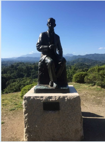
Statue of Rentaro Taki

My next stop in Taketa was the Oka Castle Ruins. Taki himself frequented these ruins. In fact, the song "Kōjō no Tsuki" is about the Oka Castle Ruins.