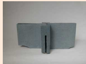
The 13 th Winning Artworks (1 Grand Prize Winner <top left> & 6 Merit Award Winners)