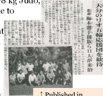
↑ Published in Brazil's “Nikkei Shinbun”